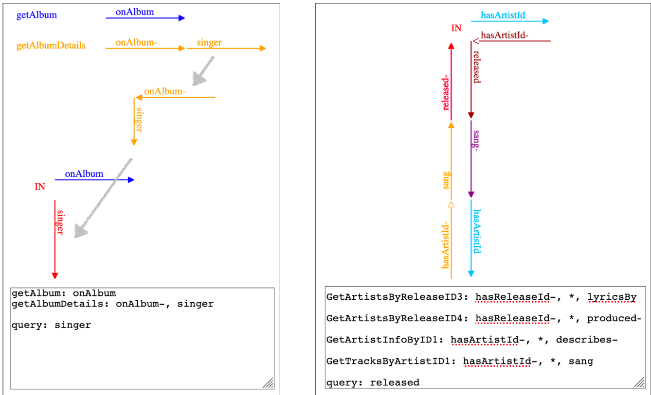
Figure 2: Screenshots of our demo. Left: Our toy example, with the functions on top and the plan being constructed below. The gray arrows indicate the animation. Right: A plan generated for real Web service functions. In both cases, the bottom box contains the function definitions and the query.

shape, but we do not have functions that would allow us to construct a plan of this shape. In order to find those sequences of relations that correspond to execution plans, we need the language of all possible execution plans. In its simplest variant, this language is just the iterated disjunction of the bodies of the functions. In our running example, the language is given by the following regular expression E :